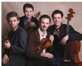
Brooklyn Rider String Quartet